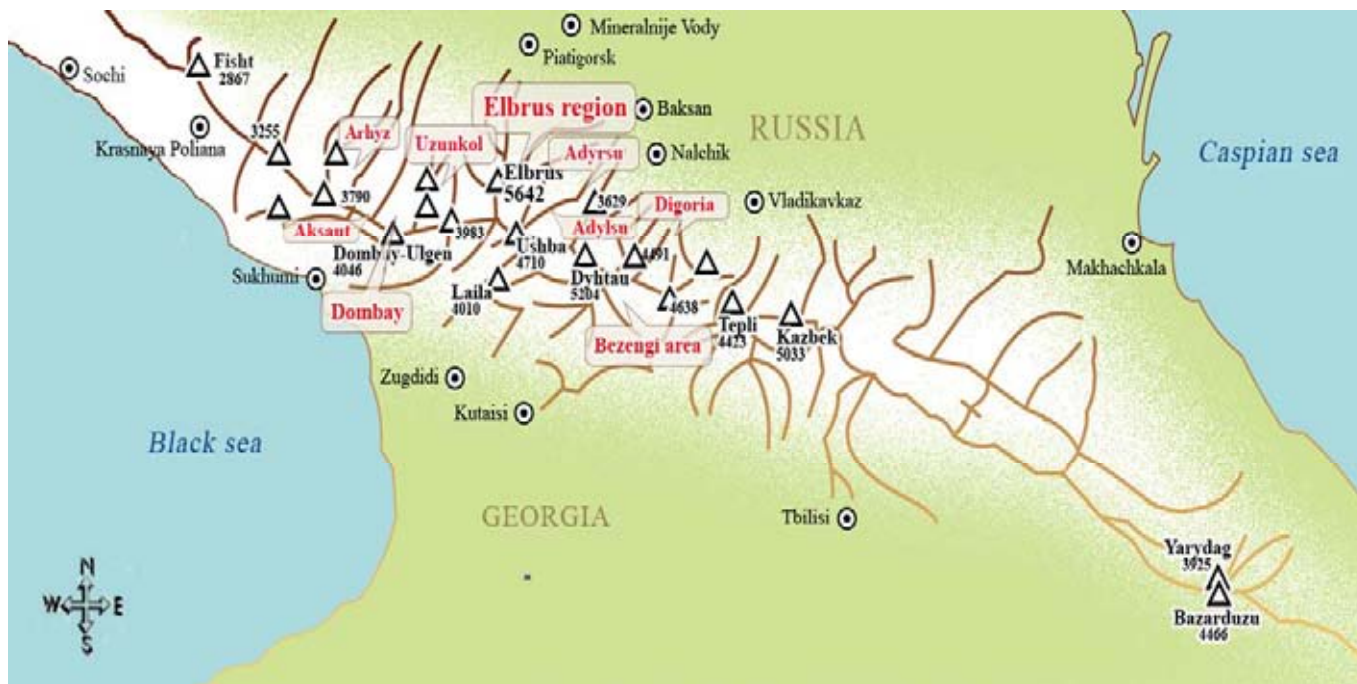
Map of the Caucasus