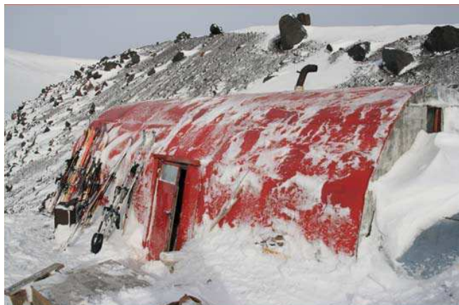
Uncle Nick Hut

Ski tour to Uncle Nick Hut 3760m. Instalation to the hut.