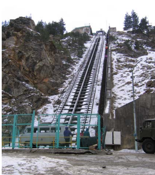
Adyrsu car lift

Day 1 Flight to Min Vody, arrival. Transfer to Adyrsu valley. Ullutau Mountaineering Camp, 2300 m. Refuge 2, 3, 4 bed rooms; WC, shower on the floor.