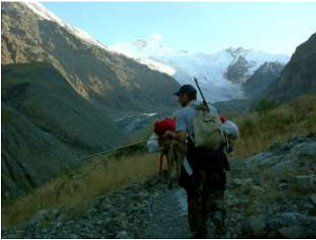
Maily glacier from Karmadon valley