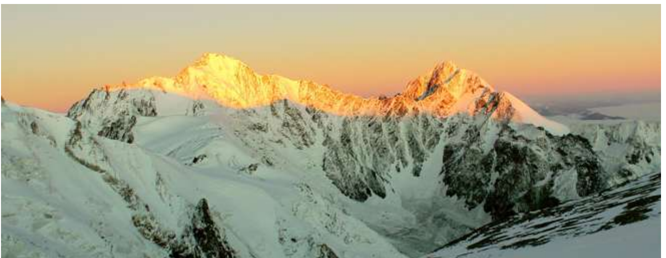
Morning view to Djimara 4780m and Shau-hoh peaks 4638m from Camp2 4150m