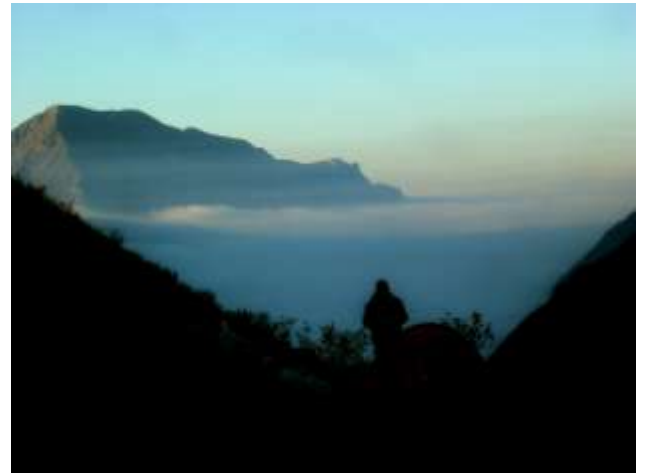
View from Base Camp 2300m

Day 3 (09.06). We climb up to the start of the Maily glacier (2450 m) through moraine ridge. We must be careful because glacier is open. Sometimes we need to use crampons. There are some steep places after 2770m of altitude and maybe we will use fixed rope (approximately 100 meters of way). There is not so steep slope after (average slope of 32 degrees) but we must be concentrating at climbing too. Beautifully-facing Camp1 place at 3400m, rewarded our hard all-day's work. There is a greatest view to crevasses of Maily glacier and all circuses of mountains with highest point Djimara Peak (4780m) from Camp 1. In evening time we may see lights of Tmenikau village and Vladikavkaz city. Tent accommodation.