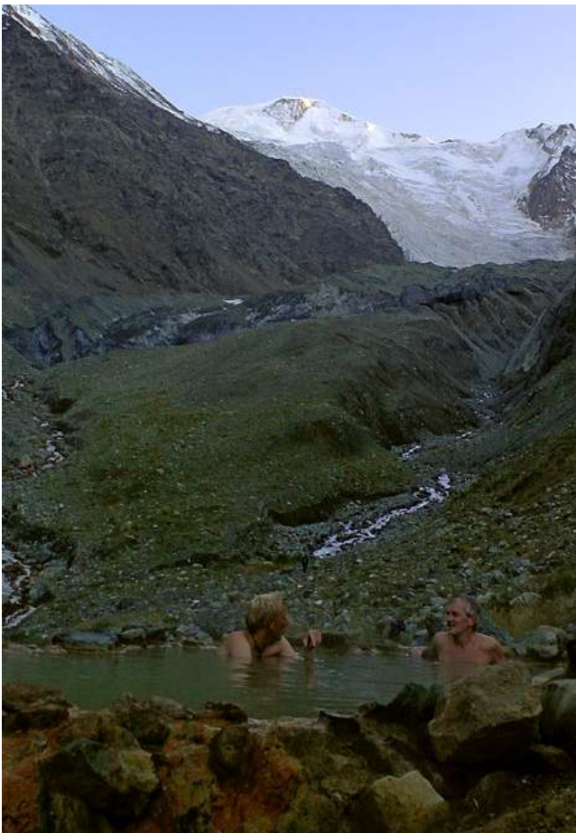
Hot spring in Base Camp