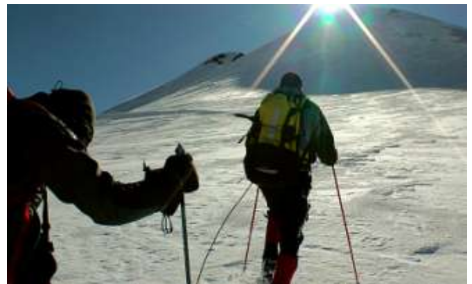
Under Kazbek slope