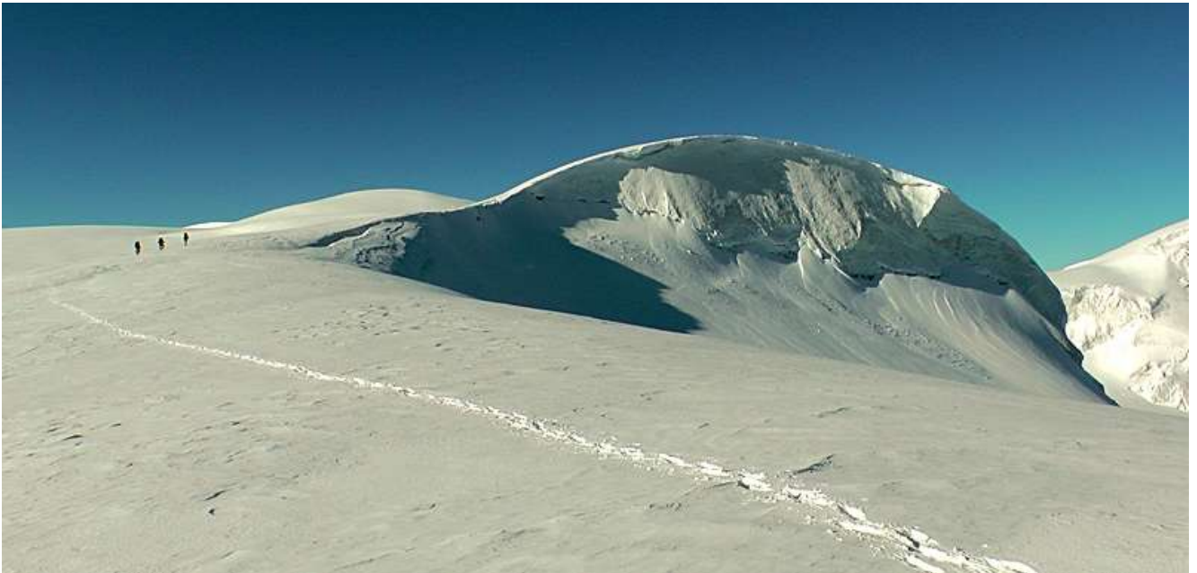
At the top of Maily pass 4400m

Day 5 (11.06). Summit day! After breakfast inside the tent we take on our harness and crampons. After two hours by Maily plateau we are reached to rocky head of Maily pass 4400m (30 degrees of slope maximum). Perfect view to all Kazbek plateau and our goal for today. Small descent from pass and cross the Kazbek plateau straight to the Kazbeksky pass 4480m. This point brings together Russian and Georgian ascent route, actual summit climb takes place on the exact same route. We still cross glacier, and after almost 3 hours to reach the "gateway" to the summit. The Mt.Kazbek consists of the small summit, 4890m and the large summit, 5033m. We traverse the slope of small Kazbek along the 30 to 35 degrees ice field (in the snow takes longer) to the saddle direction 4800 m. The last part of slope (10m high ice with snowdrift) quite steep, and we should go very cautiously. Rest before final challenge of the steep and sometimes bare summit ice cap. In the steep ice slope with crampons and partly through rocky passages, we are climbing our final part of the ascent way. Sometimes we need to mobilized all our forces for crossing this ice part (maybe we put a fixed rope) and then culminate TOP - the most eastern five thousand meters peak of the Caucasus rewarded us with a wonderful panoramic view of Central and Eastern Caucasus! At the clean weather we can see another volcano, a giant of the Caucasus - Elbrus (5642 m). After 2.5-3h of descent, we reach our camp exhausted but happy again!