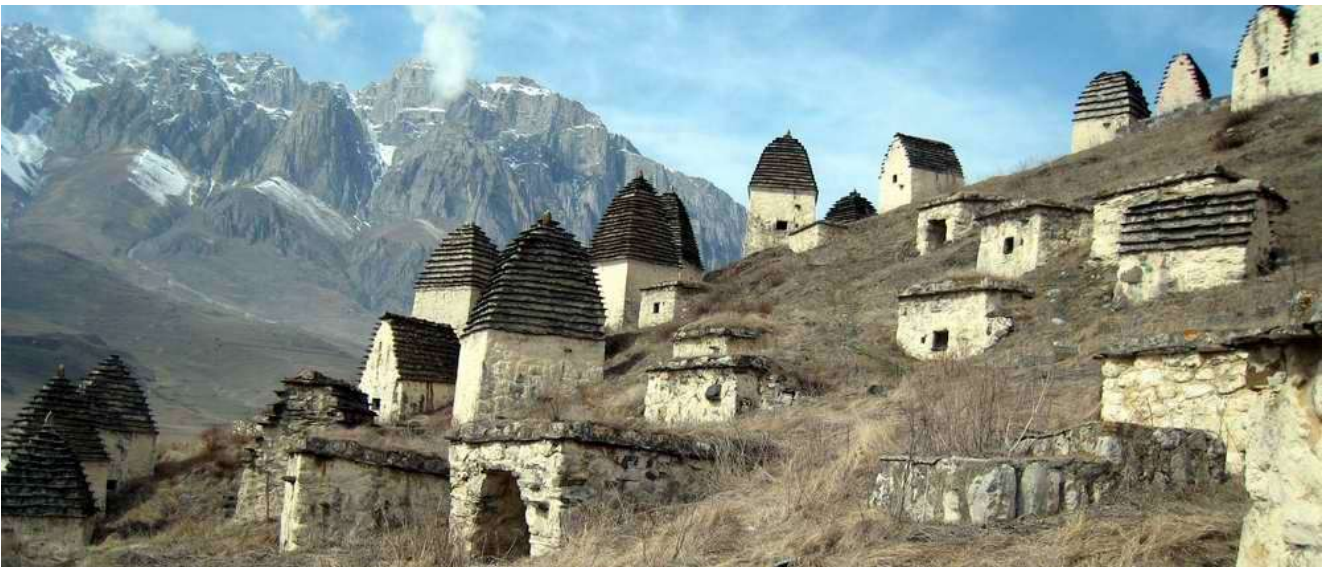
Necropolis of Dargavs city