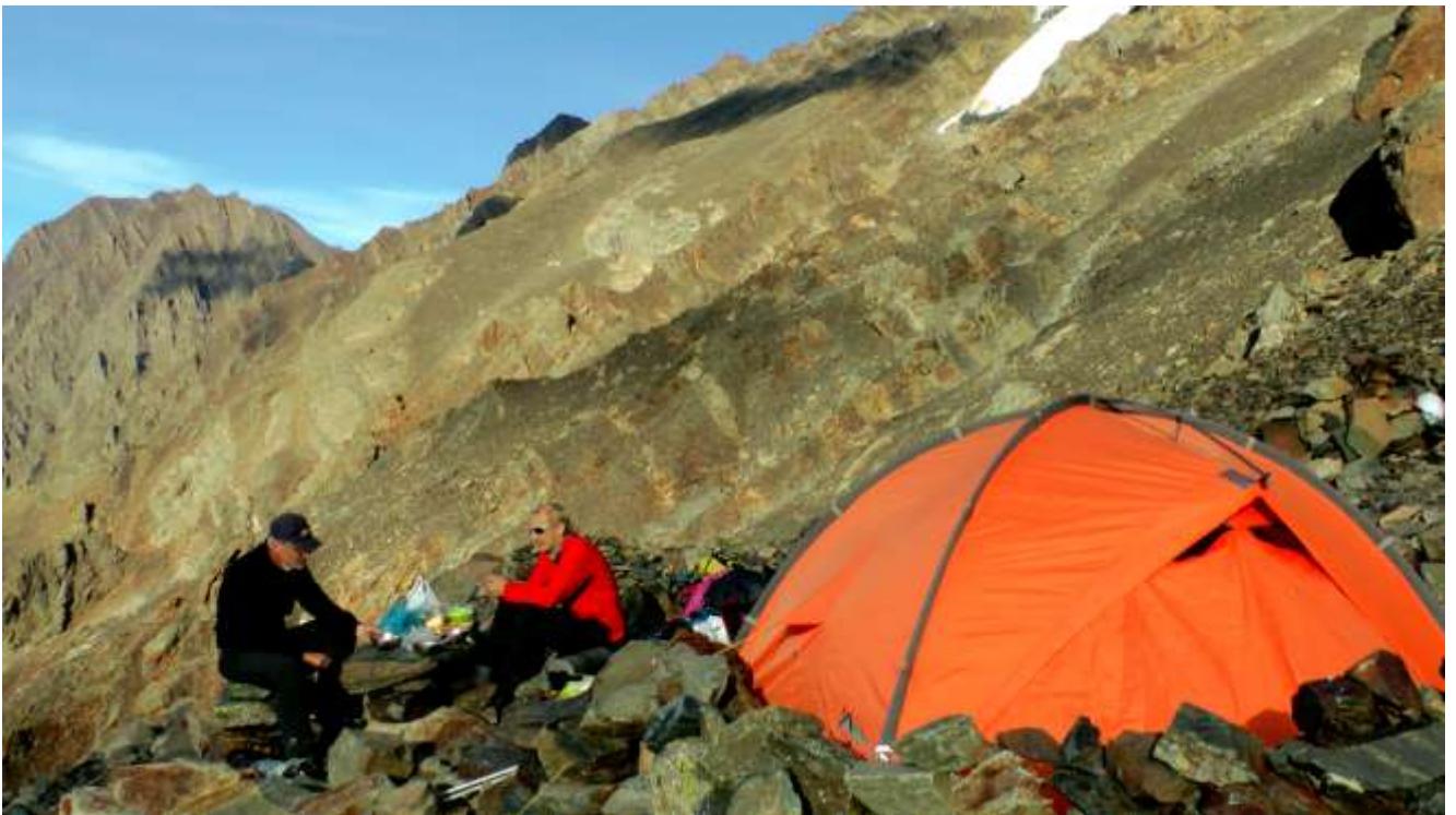
Camp1, 3400 m