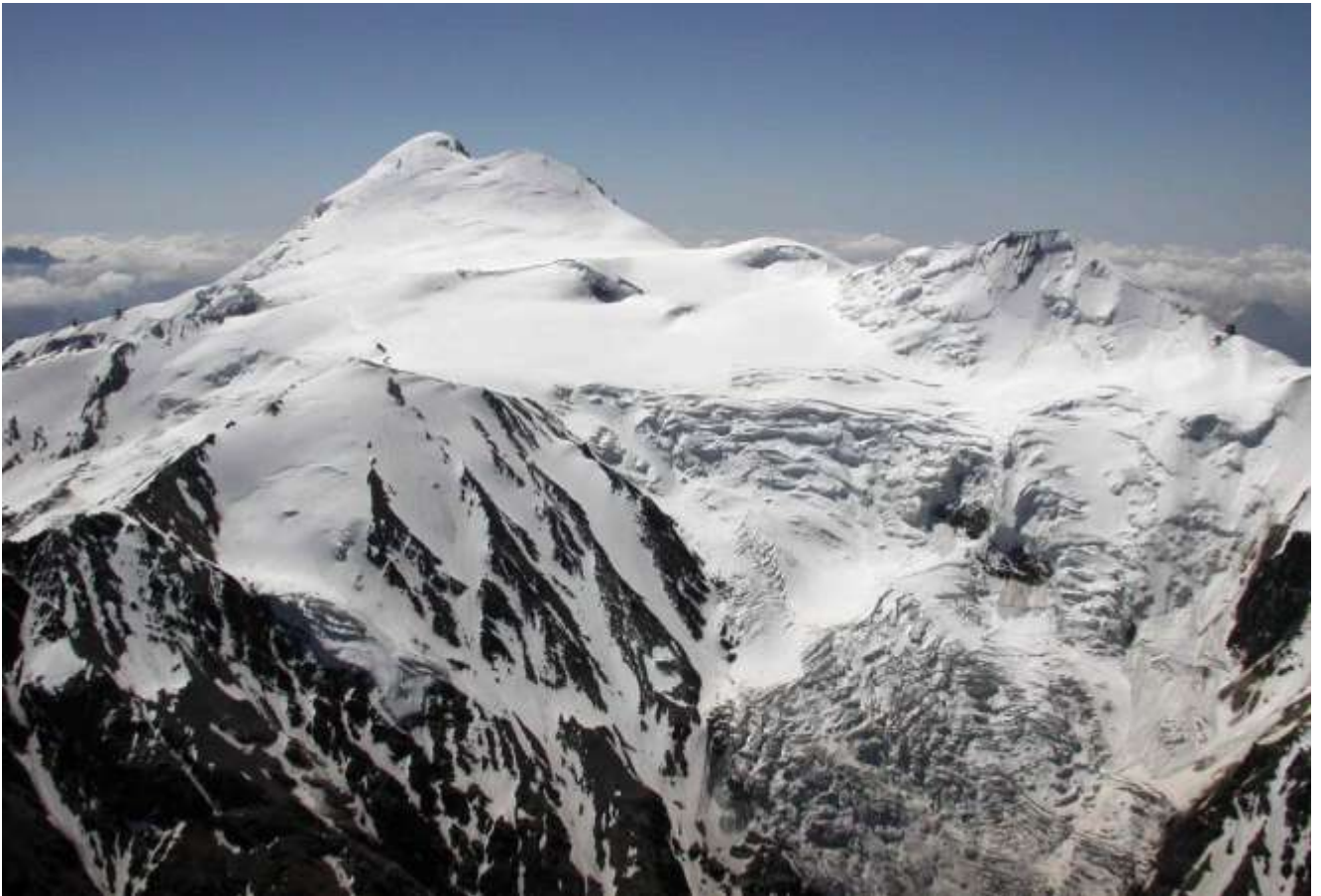
View of Maily glacier and North face Mt.Kazbek

Day 4 (10.06). Today we have 3 hours of climbing way by quite steep (sometimes 60 degrees) stone-covered slope. Some parts of trail are covered by snow (depends at season). There is only 3km of way but we must be concentrated all the time. After some rest time we have 30min. walking to Polyakov peak 4270m. There is great view to Chach glacier (Georgia side) and shapely twin-peaks of Kazbek, which we will hopefully be rewarded with a glowing sunset. Camp-2 place 4150m situated on the big stone moraine near the Maily glacier from where we will take a fresh water.