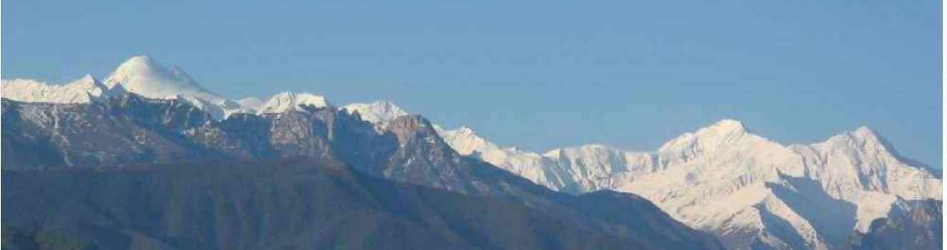
Kazbek-Djimarai, view from Vladikavkaz hotel

Day 1 (07.06). Arrival to Beslan airport. Transfer to Vladikavkaz city. At short city tour we are visit Muslim Mosque, Christian Armenian and Ossetian churches and other interest places. At evening time we are check the test of famous Ossetian pies. Accommodation in Vladikavkaz hotel.