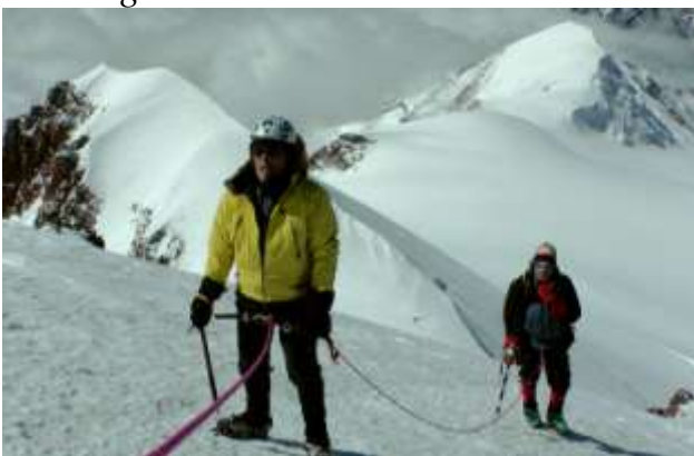
Last pitch before the summit