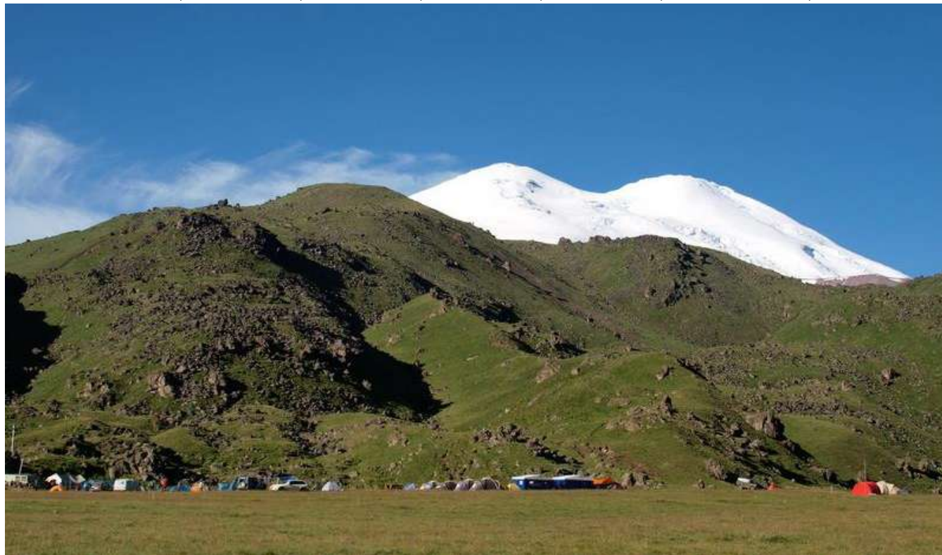
Hathansu Base Camp 2500m

Dates: 09.06-17.06, 16.06-24.06, 23.06-01.07, 30.06-08.07, 28.07-05.08, 01.09-09.09, 08.09-16.09