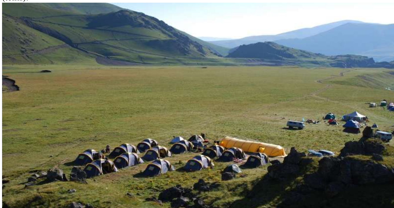
Hathansu Base Camp 2500m

Day 2. Transfer to Hathansu meadow 2500m, 100km, along the Malka river valley. Hathansu Base Camp (tents).