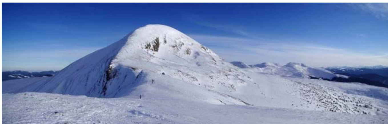
Howerla peak 2061m

Day 4 Transfer to Zarosliak. Ski tour to Howerla 2061m, the highest point.