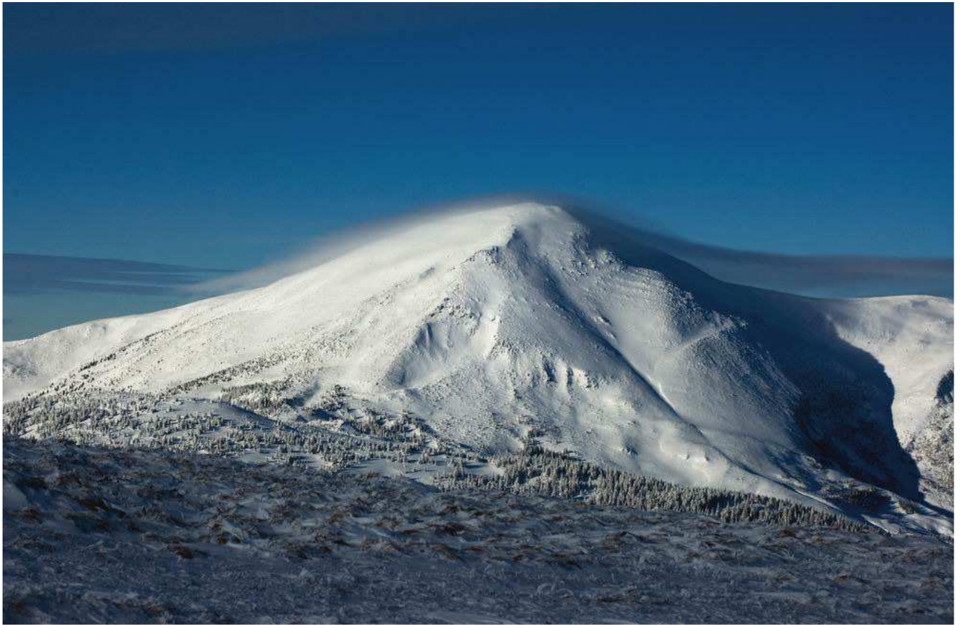
Petros peak 2020m

Program: 26/02-05/03/11; 05/03-12/03/11; 12/03-19/03/11; 19/03-26/03/11