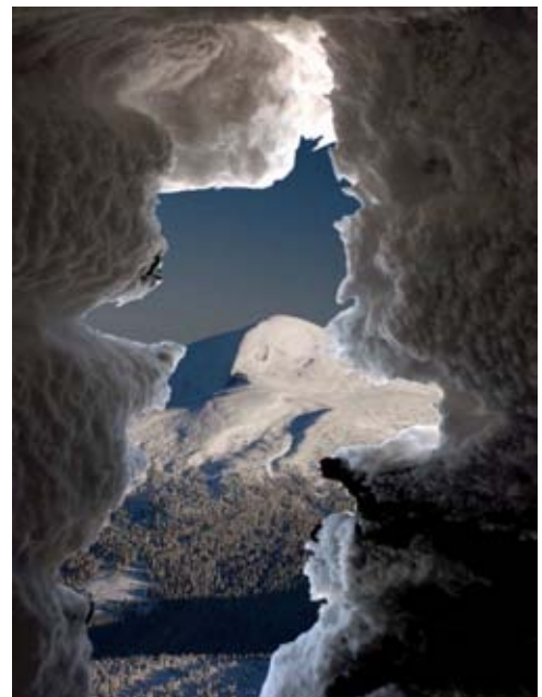
Howerla peak 2061m