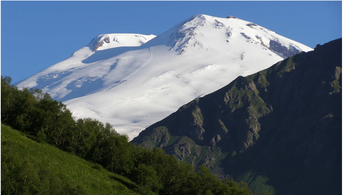
Mt.Elbrus from the South

Program 2011: June-July-August-September