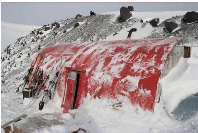
Uncle Nick Hut

Day 5. Ski tour to Uncle Nick Hut 3760m. Instalation to the hut.