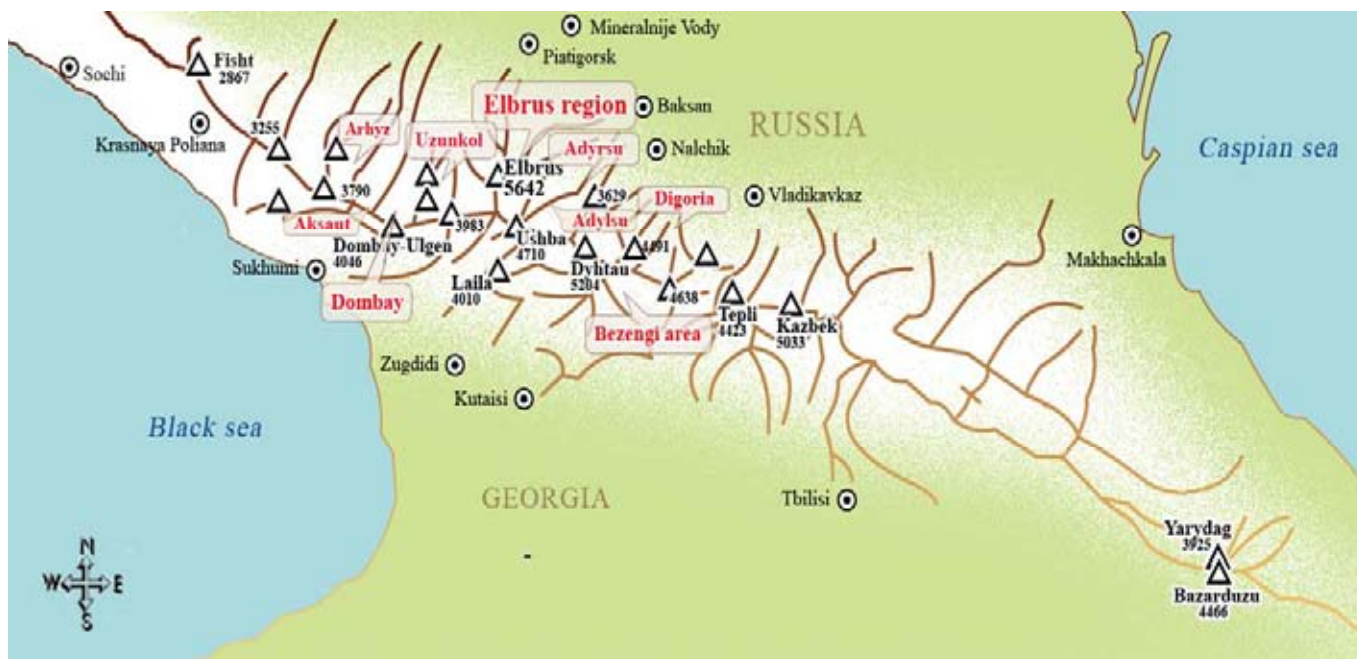
Map of the Caucasus