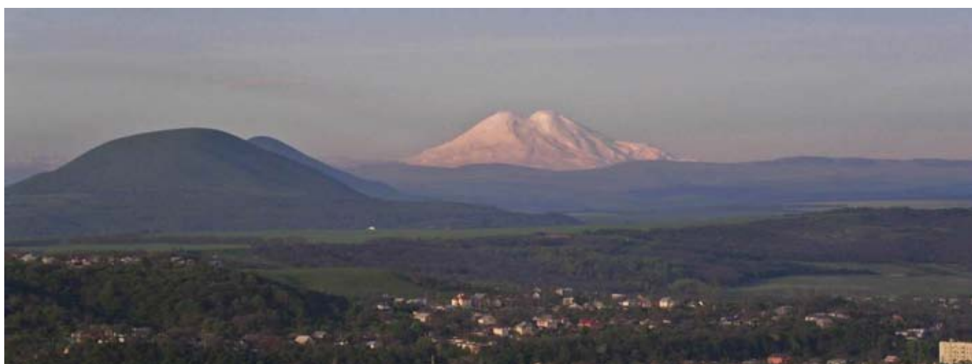
View from Intourist hotel

Day 8. Transfer to airport Min. Vody. Departure flight 12h40.