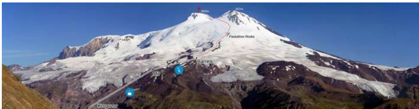
Way to Mt.Elbrus from the South