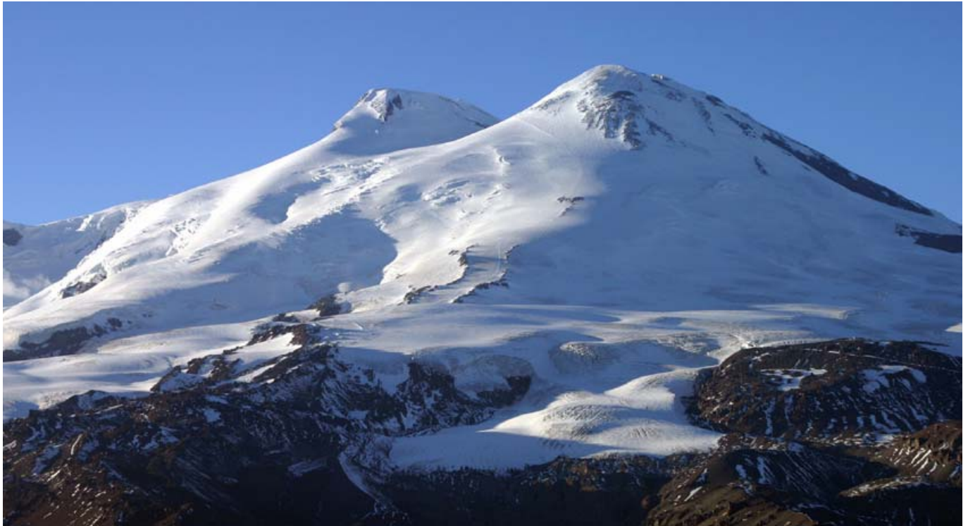
Mt.Elbrus from the South

Program 2010: 19.06.-26.06.; 10.07.-17.07.; 31.07.-07.08.; 28.08.-04.09.