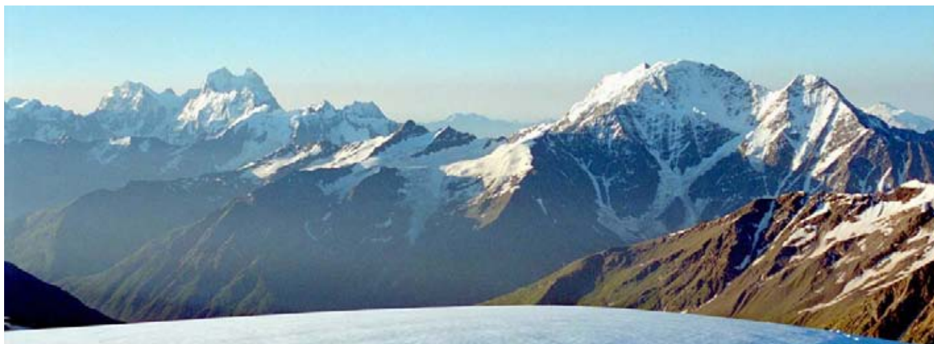
View from Elbrus slope

Day 6. Summit day Mt.Elbrus 5642m. (Option: Using Snowcat to Pastukov rocks ab. 4650). Barrels hut.